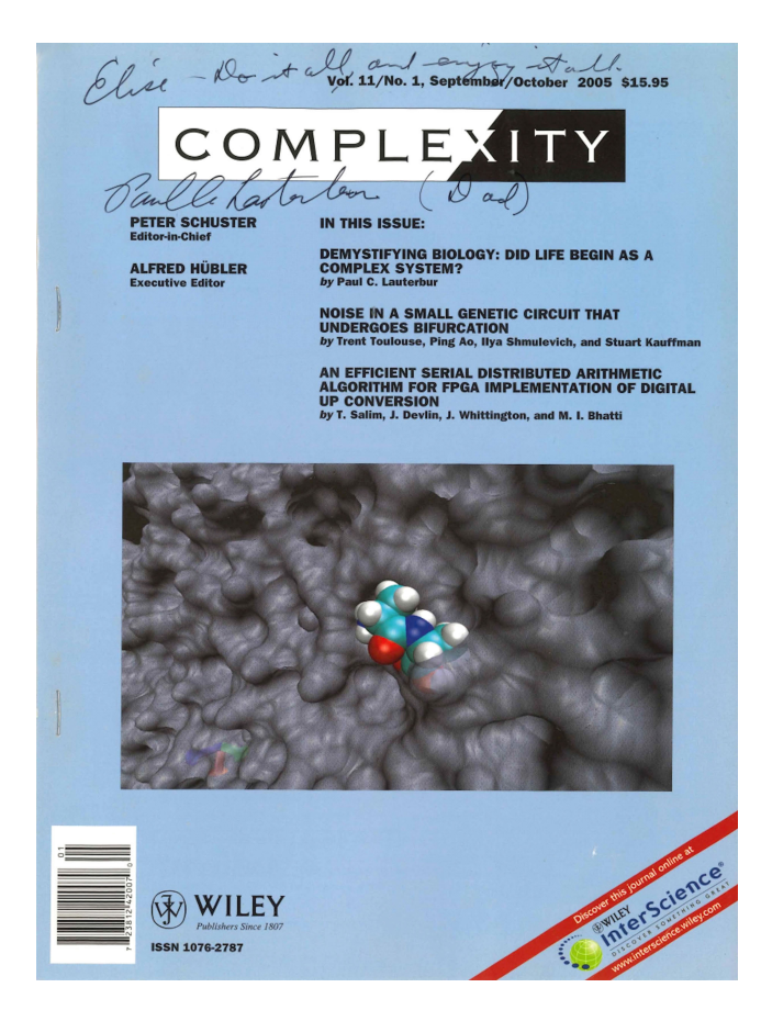
Figure 8: Signed copy of Paul Lauterbur's last article, 'Demystifying Biology: Did Life Begin as a Complex System?' Inscription reads 'Elise—Do it all and enjoy it all. Paul Lauterbur (Dad)'.

This is a special year that marks the 50th anniversary of Paul's invention of zeugmatography, now known as MRI. On 2 September 1971, Paul wrote down in his notebook the ingenious idea for image formation using magnetic resonance. He wrote: 'The distribution of magnetic nuclei ... may be obtained by imposing magnetic field gradients ... on a sample, such as an organism or a manufactured object, and measuring the intensities and relaxation